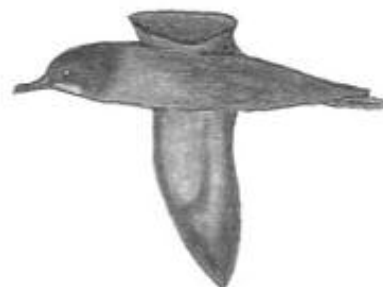
Short tailed Shearwater (Muttonbird)