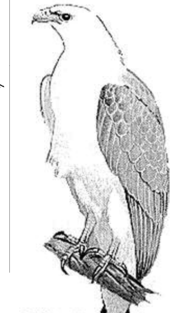
White Breasted Sea Eagle