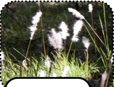
Imperata cylindrica Blady Grass