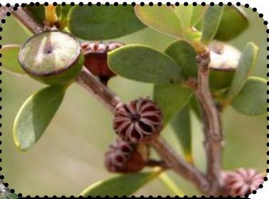
Leptospermum laevigatum Coastal Tea tree