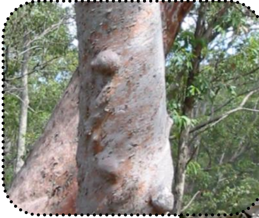
Angophora costata Smooth- barked Apple