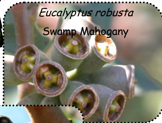
Eucalyptus robusta Swamp Mahogany