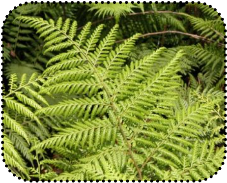
Pteridium esculentum Bracken Fern