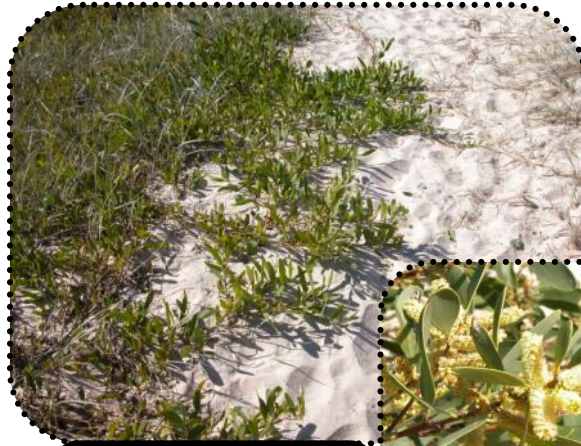
Acacia sophorae Coastal Wattle

In these reconstructed native plant communities, low species diversity is a common issue, though the opportunity now exists for enrichment planting of mosaics of unrepresented local dunal communities to be established as part of Landcare/Dunecare's follow-up of dune maintenance and weed control works.