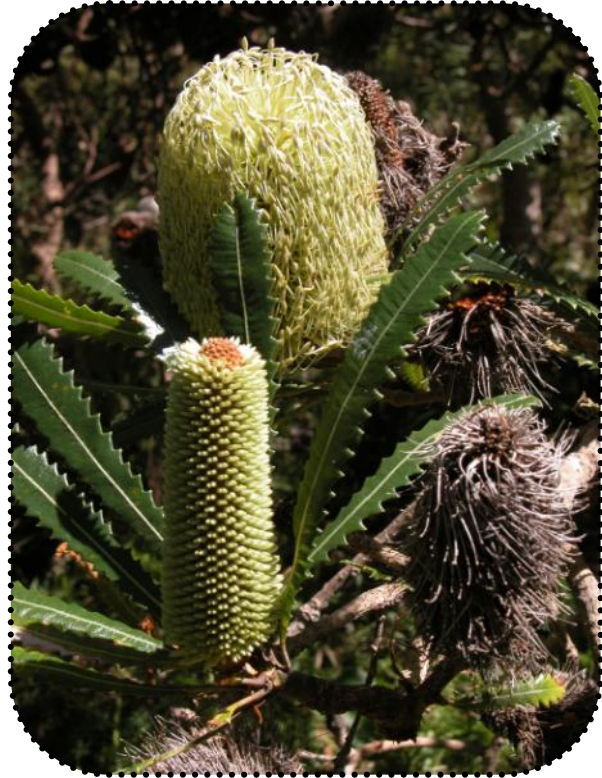
Coastal Sand Apple- Blackbutt Forest