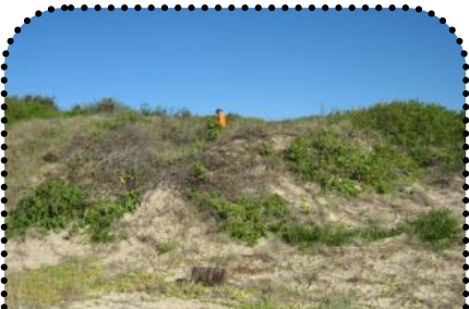
Before and after Bitou Bush removal