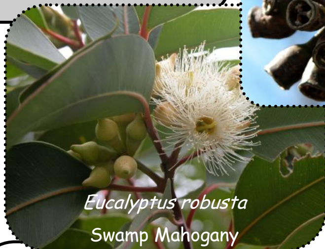
Eucalyptus robusta Swamp Mahogany

In areas where natural vegetation communities remain or have been reinstated, foredune areas are fairly well-vegetated with