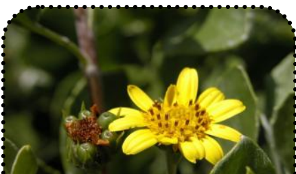
Chrysanthemoides monilifera Bitou Bush