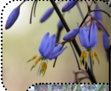
Dianella caerulea Flax Lily