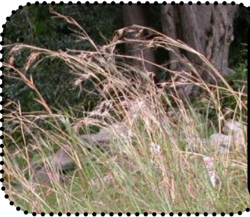
Themeda australis Kangaroo Grass