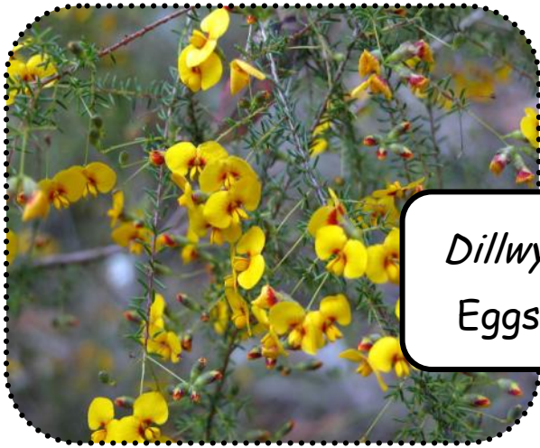
Dillwynia retorta Eggs and Bacon