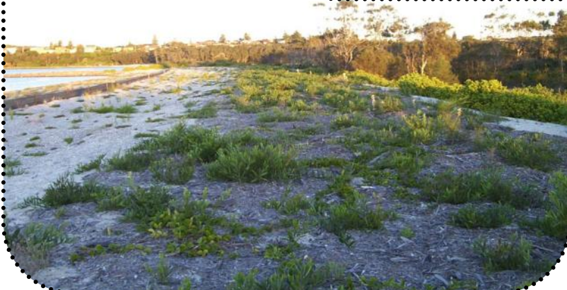
Salts Bay stabilisation work