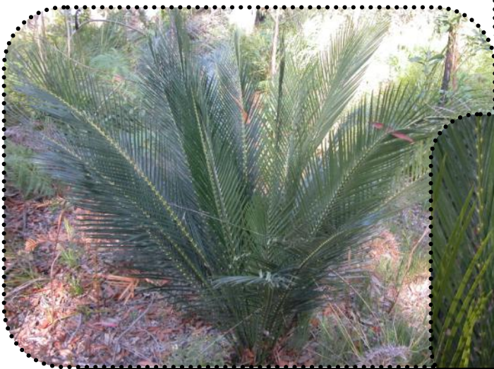
Macrozamia communis Burrawang