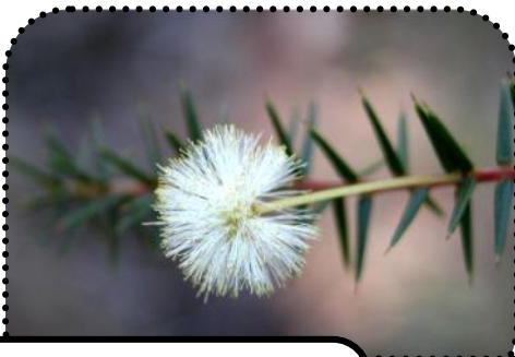
Acacia ulicifolia Prickly Moses