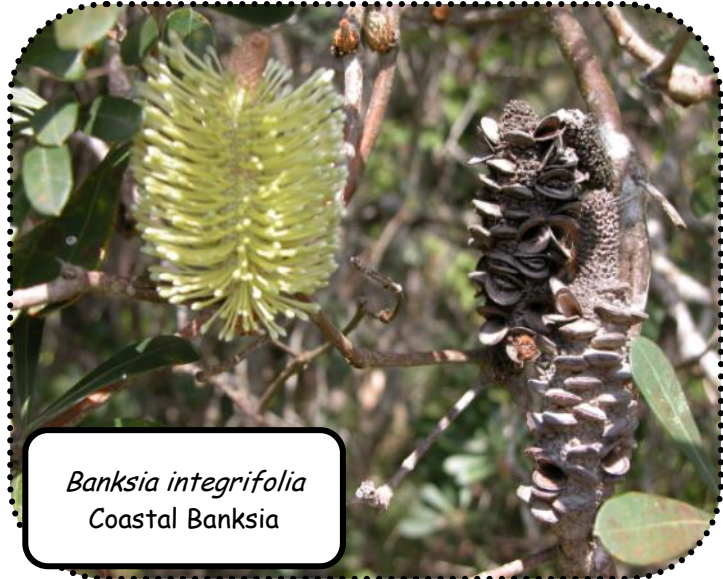
Banksia integrifolia Coastal Banksia