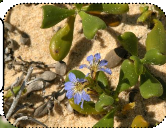
Scaevola calendulacea Scented Fan Flower

Spinifex , Scaevola , Carpobrotus and Acacia , while the hind-dunes are generally a mix of native plant species; Banksia integrifolia , Banksia serrata , Leptospermum spp. , Monotoca elliptica , Melaleuca nodosa , Allocasuarina distyla .