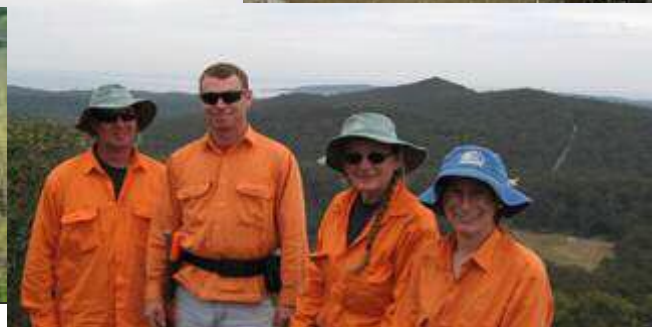
ONE OF THE REGIONAL OFFICES - MINT HILL-KARARA- PORT STEPHENS