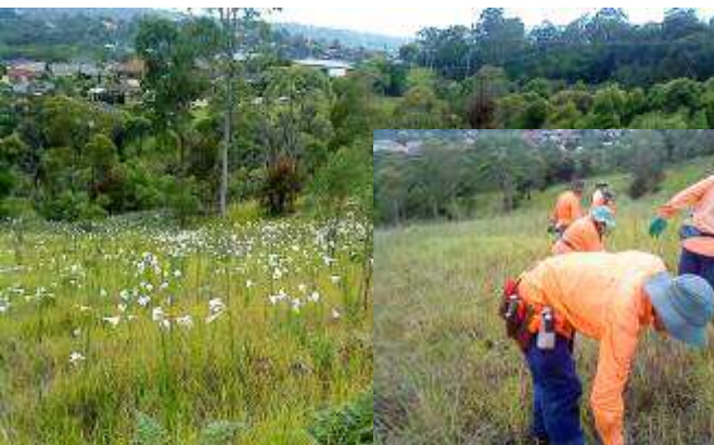
THE FORMOSA LILY FIELD AT MUNIBUNG HILL. THE WHITE FLOWERS IN BLOOM. A CURRENT REGEN PROJECT