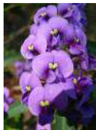
THE OFFICE FURNITURE HARDENBERGIA VIOLACEA