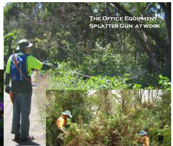
THE OFFICE EQUIPMENT SPLATTER GUN AT WORK