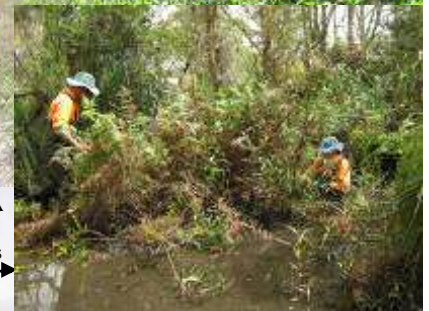
THE WATER COOLER AKA WEEDING MAMBO SWAMP PORT STEPHENS