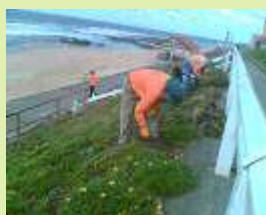
TIN VOLUNTEERS AT MEREWETHER BEACH

The propagation process for the coastal plants can be as quick as two months when it's warm or as long as five months when it's cooler.