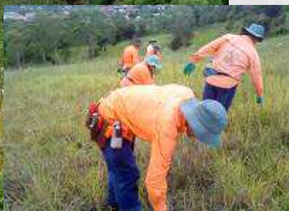
FROLICKING IN THE FORMOSA FIELD AT MUNIBUNG HILL, LAKE MACQUARIE - ALL IN A DAYS WORK