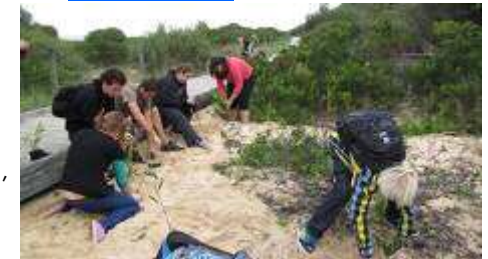
Belmont High students planting at Redhead Beach

If you know of a school, preschool, TAFE or youth group in Lake Macquarie that would like to undertake an on-ground project or help to build the L4Y student and teacher networks, let us know at TIN, ph 4969 1500 or education@treesinnewcastle.org.au . There are resource request forms on TIN's website